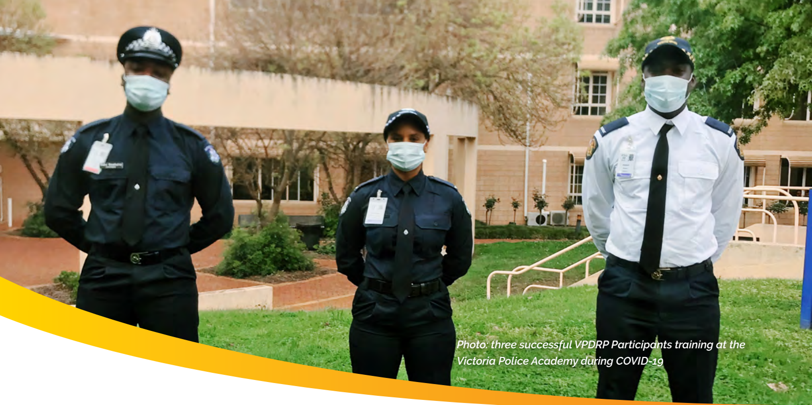
Photo: three successful VPDRP Participants training at the Victoria Police Academy during COVID-19