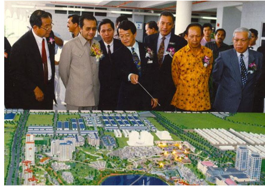
Owned and governed by the