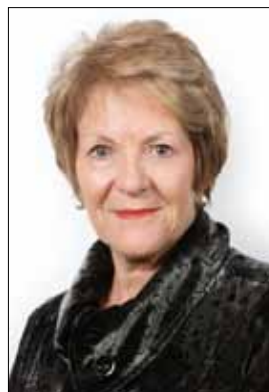
The Deputy Chancellor, Commissioner Dianne Fogg