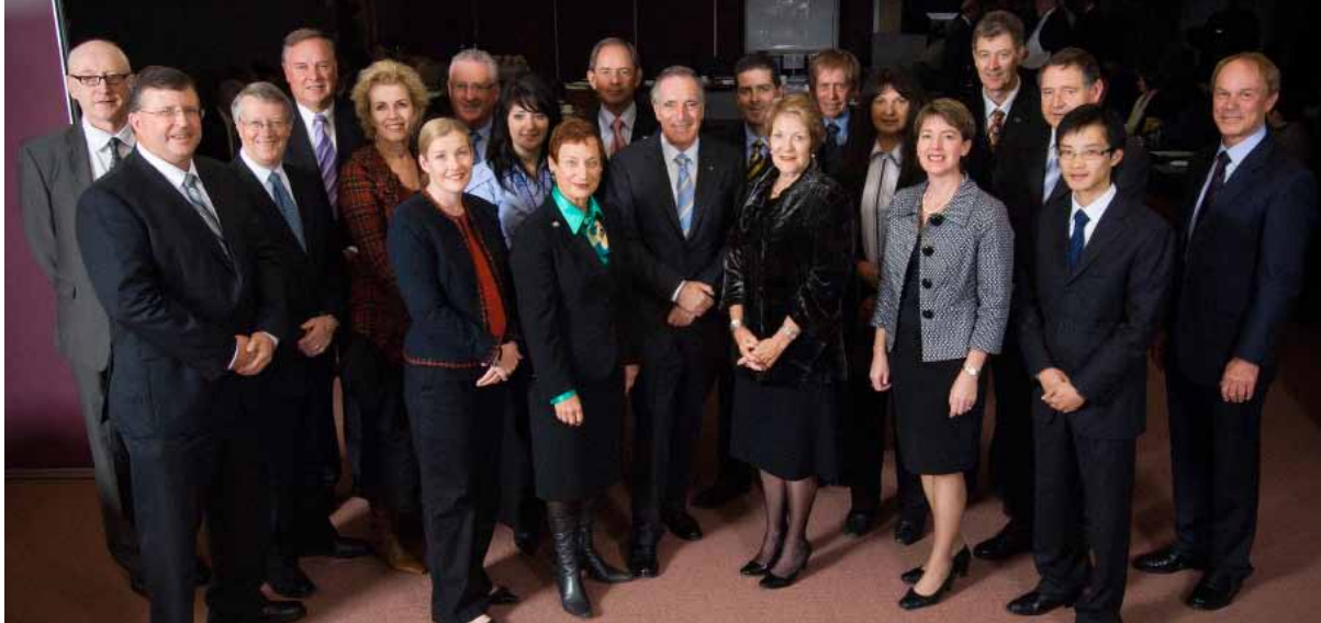
2009 VU Council members.