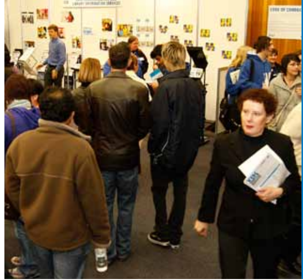
VU Open Day.

There is also a range of less formal events you may be invited to or have the opportunity to attend, where you can engage actively and freely with the life and people of the University: