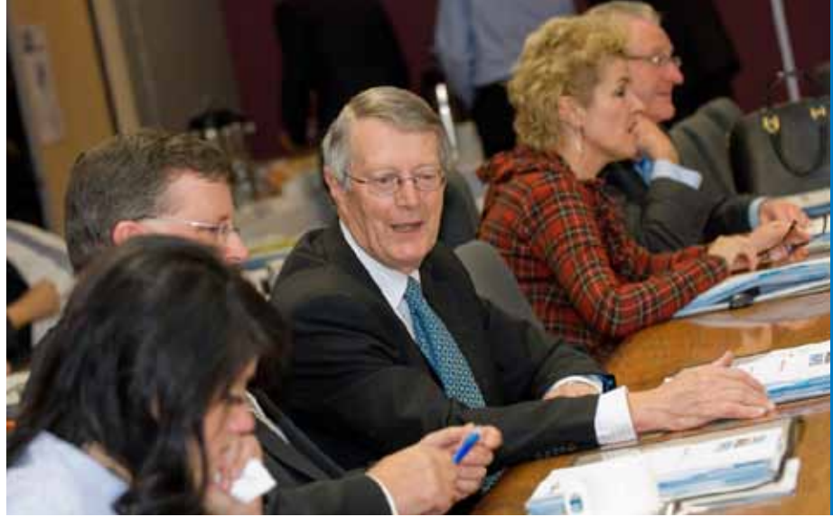
VU Council meeting in 2009.