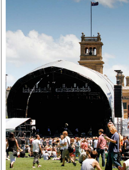
The Werribee Park Harvest Festival.

Particularly as automotive manufacturing industry slows with the end to local car production, food manufacturing should be strongly encouraged to grow taking up some of the displaced workforce. The Werribee Employment Precinct and other industrial land in the area provides scope for the attraction of food manufactures in the more inner parts of Melbourne to relocate to the Werribee area. The development of the food innovation centre would complement the activities and skill base attracted by the AEC offering strong economies of scope.