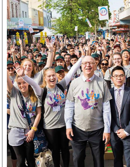
Part of the Victoria University community.

Education is the fifth largest sector (c26,000), growing at around 6 per cent per annum, and the cluster of professional service industries employs about 60,000 people with growth of about 2-3 per cent.