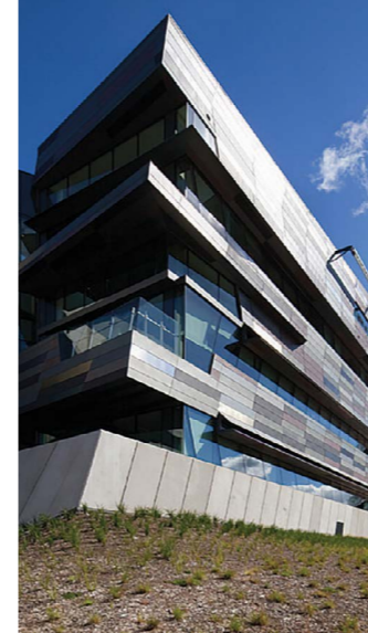
Victoria University's Institute of Sport, Exercise and Active Living is a world leader in the field of Sports Science and Biomechanics.

Redevelop the Footscray Hospital to VU's Footscray Park Campus as part of a Health, Sport and Active Living Precinct. Further develop the Footscray Learning Precinct, centred on VU's Footscray Nicholson Campus.