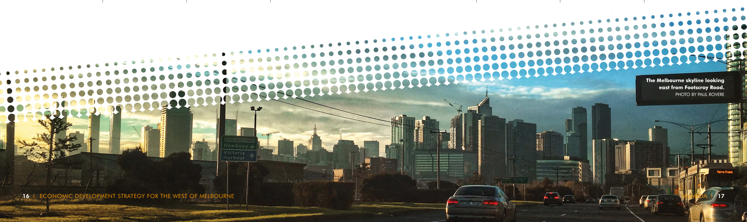
The Melbourne skyline looking east from Footscray Road.

An effective and efficient economic development strategy must draw on the existing and evolving strengths of VU, which has a specific legislative obligation to serve the six LGAs comprising the West and the city of Hume, and to work closely with each of these councils nominated in the Act.