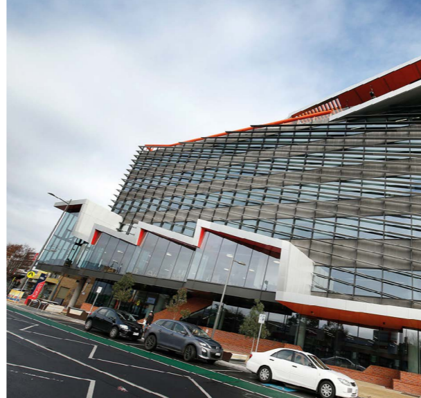
The new Sunshine Library is located over the first two floors of the Brimbank Community and Civic Centre.

Planning and rezoning should be developed in a way that complements the development of the hubs.